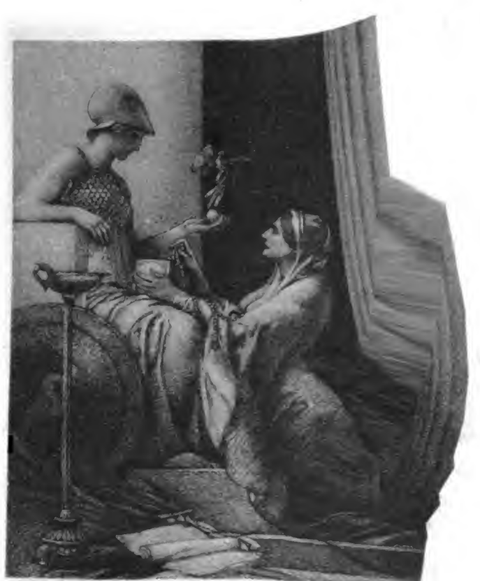
STANFORD - VNIVERSITY - LIBRARY